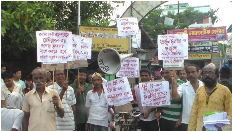
A road show demanding proper supply of AVS to the hospitals & submitting a petition in that regards, 2015