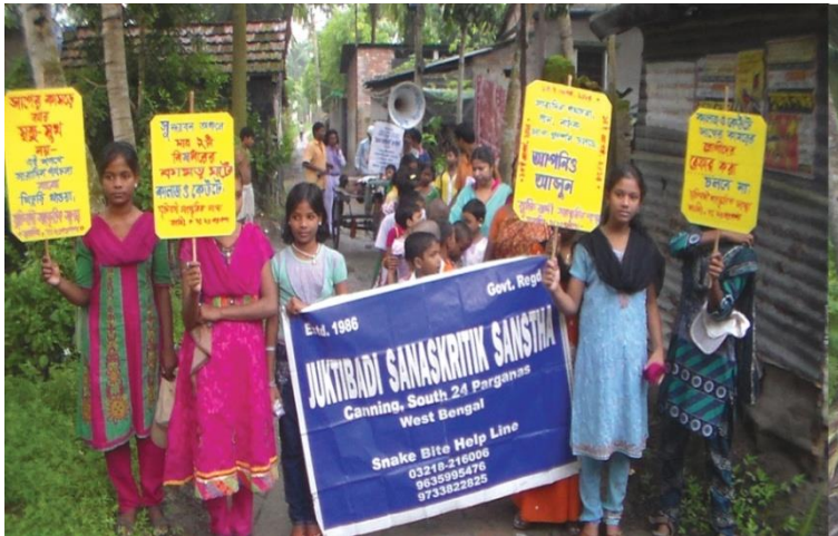
10 Kilometer road show on 15th August, campaigning on snakebite awareness, 2013