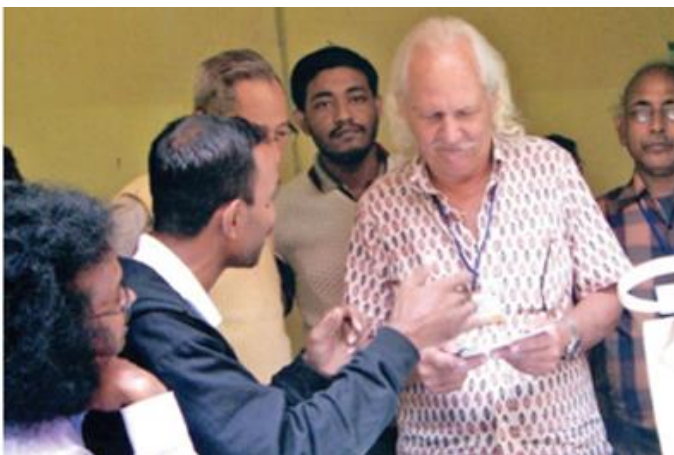
World famous Herpetologist Romulus Earl Whitaker with JSSC members, 2012