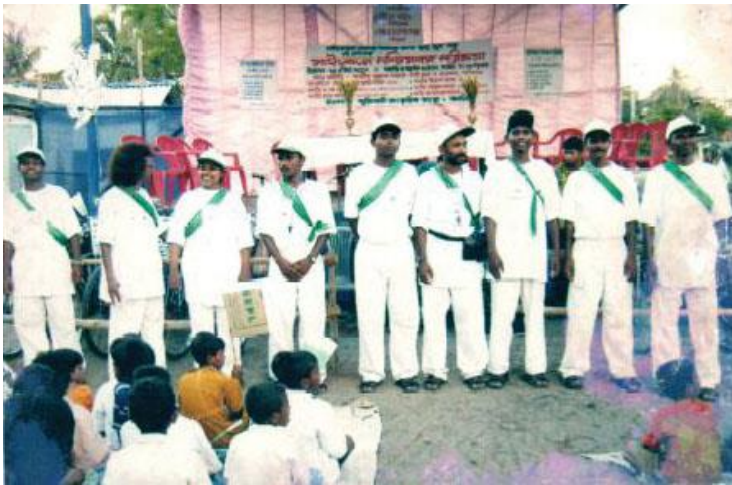
Going around West Bengal on bicycles, campaigning on snakebite awareness, 2007